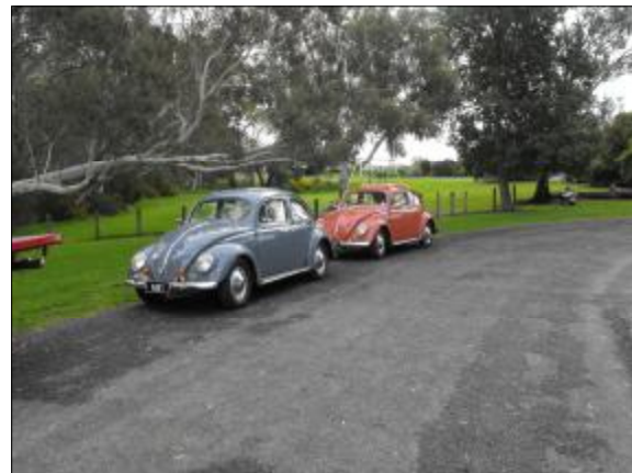
Top 2 Bottom— Steve Muirhead covets a Rover. A smart Hudson Terraplane & why there were so many VW Beetles—they mate at Old Car Days!