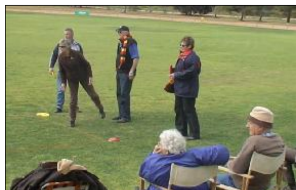
Below— The Disc Bowls Final at Pr Broughton

You are invited to a Weekend of Motoring Nostalgia and Adventure