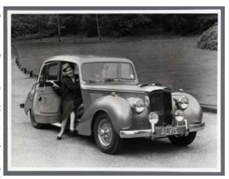
I'd like to say this is Mary getting out of the new purchase, but not quite ready yet. To think this is a car sold in 1955, the year Citroen brought out the DS19. It's certainly a contrast.

As for the car, it will need work over the next year, but it is a relatively rare model having one of the last Mulliner bodies fitted. It has the "go faster" options that were added as the Alvis company tried to sell move more of the cars. That means wire wheels, 100 HP engine, higher diff ratio, so 100MPH, and some big lamps!