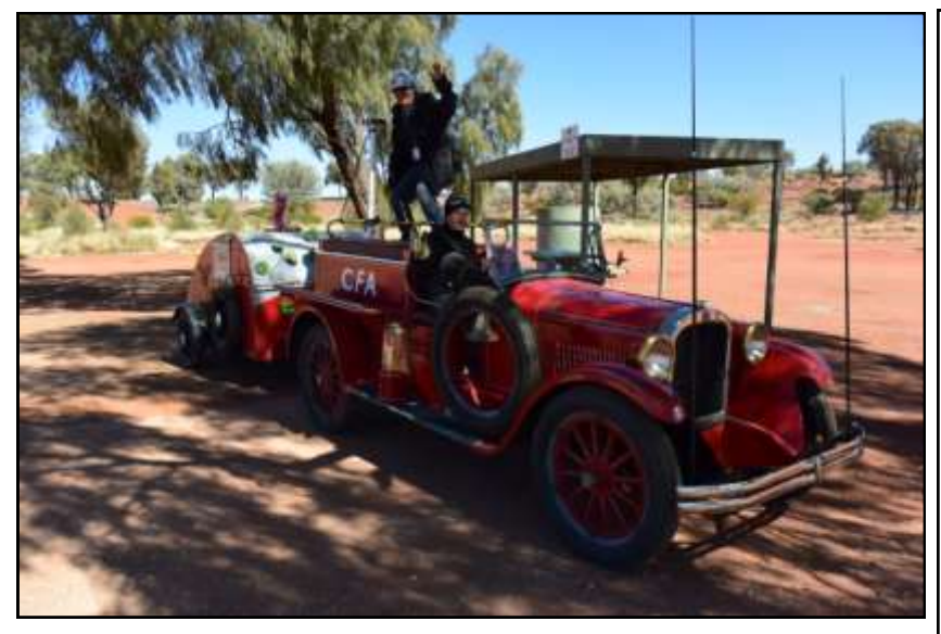
If the driver of the Dodge Fire Appliance got pulled over by the cops, do you think the police officer would ask, "OK Sir, so where's the fire?"